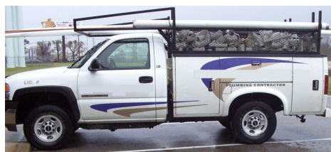
In 4" ID or greater PVC pipe on roof, or inside service vehicle