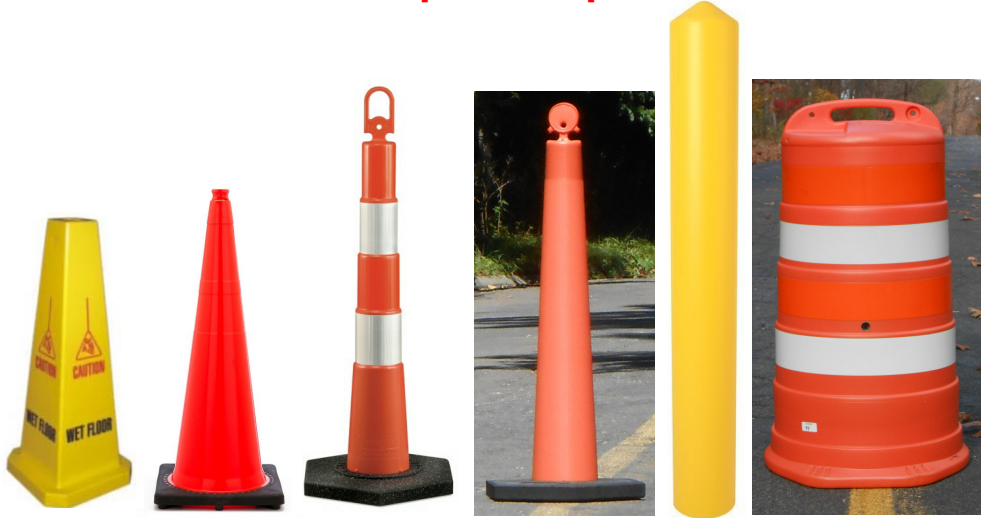
In non-metallic tall traffic cones, traffic channelizer cones and bollard covers, with at least 4" ID at the vertical center, and traffic barrels and storage drums