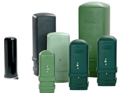
In non-metallic optical fiber splice tubes and broadband Internet enclosures