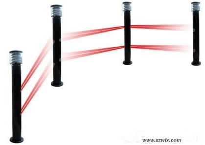
In non-metallic, hollow fence posts and bollard covers with at least 4" ID