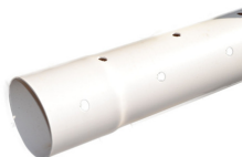
In plastic drain or sewer pipe with at least 4" ID