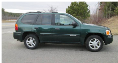
In passenger vehicle or roof carrier