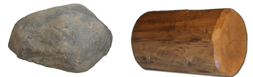
In faux rocks and logs