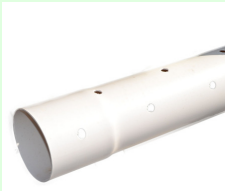
Plastic drain or sewer pipe with at least 4+” ID