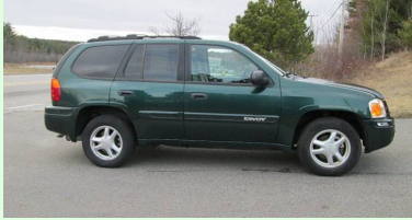
In passenger vehicle or roof carrier