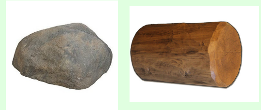
Faux rocks and logs

Mount The Rabbit ™ horizontally or vertically for wide utility and still have proper video and pan-tilt