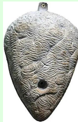
Faux Wasp Nest