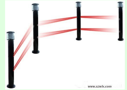
Non-metallic, hollow fence posts and bollard covers with at least 4+” ID