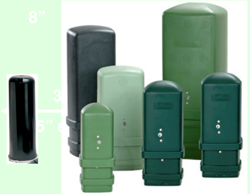
In non-metallic optical fiber splice tubes and broadband Internet enclosures