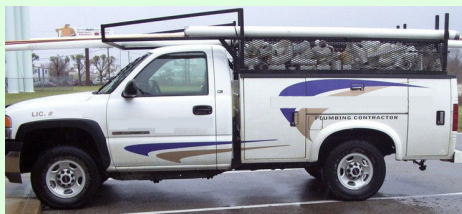
4+” ID or greater PVC pipe on roof, or inside service vehicle