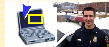
Mobile Command Center

Boundless' opt. VPN & Tunneling Broadcast Server supports Live Alerts , dynamic IP addresses, non-inward-routable networks, encryption, and security certificates, and enables many to view same live or recorded video stream in Boundless' Control Panel client simultaneously without over-burdening slow uplinks.