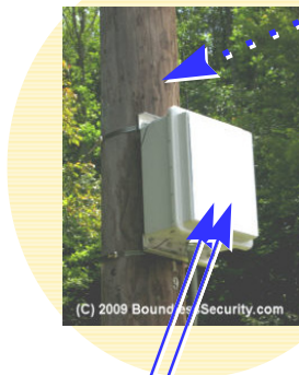
Two concealed PTZ cameras with up to 36X optical zoom

Internal Boundless' Multi-Stream Video Server creates three to eight internal IP-video streams per camera simultaneously, with different resolutions, frame rates and data rates, optimizing video for live and recorded remote viewing for situation assessment , monitoring and investigations . Three resolutions are produced simultaneously for each one of the internal cameras. Live video can be viewed remotely with as little as 8 Kbps.