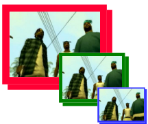
VGA, QVGA, QQVGA

June 24, 2009 Preliminary and subject to change without notice.