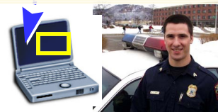
Mobile Command Center

Mobile teams view live or recorded video selected by Dispatcher on select Pocket PC, Palm Treo, BlackBerry, cell phones.