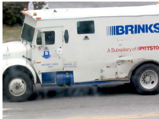
Cash and check carriers (WAN wireless)