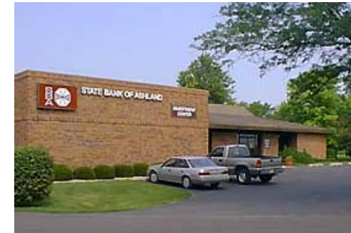
Perimeters (LAN WiFi wireless)