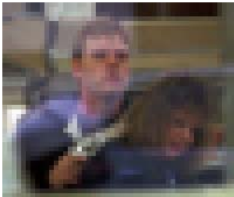
cropped, highly magnified, blurry recorded image from other systems