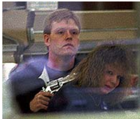
cropped, magnified sharper recorded image from Boundless Security System