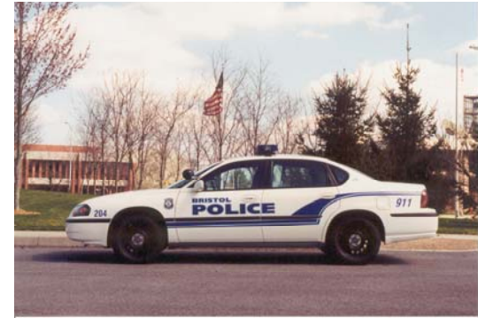
Live audio / video in police cars (WAN wireless)