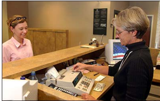
Lobby, tellers and vault