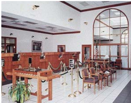
Live video throughout facilities via LAN