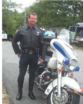
Live video on PDA or Cell Phone for first-responders