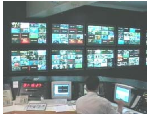
Live and recorded audio / video / event data at headquarters and monitoring companies