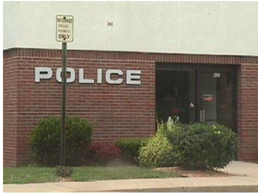
Live and recorded audio / video at police stations