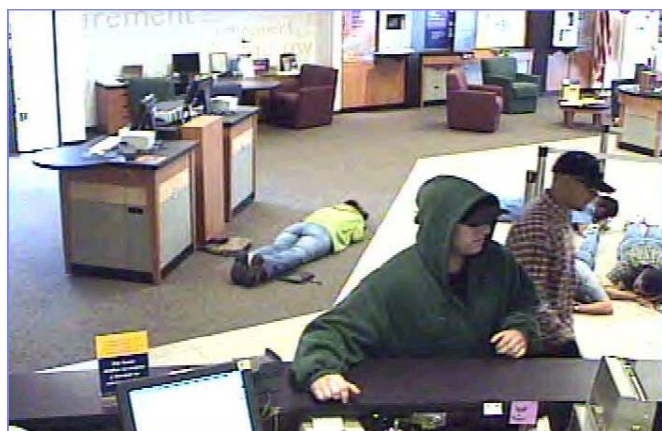
A deadly situation to avoid

Designed for the utmost image quality, reliability, survivability and accessibility because things go wrong at the worst possible times