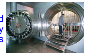
Banks, Armored Trucks, Delivery Vehicles