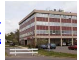
Office Buildings, Municipal Buildings, Military Bases