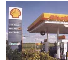
Gas Stations, Convenience Stores, Restaurants, Retail Stores

The Boundless Security System™ puts you there. There are many commercial and government applications. It is ideal for chains.