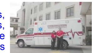
Hospitals, Retirement Homes, Continuous Care Facilities

Boundless Security Systems, Inc. (BSSI) 3 Simm Lane, Unit #1F • Newtown, CT 06470 USA 203-445-0562 x1 (Sales) • fax 203-445-0564 sales(at)BoundlessS.com • www.BoundlessS.com