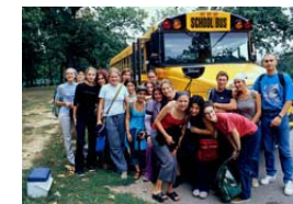
Schools, Public Transportation