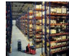
Factories, Warehouses, Storage Terminals